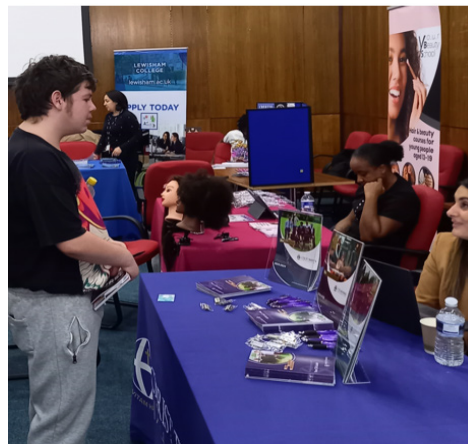
Interested: Lots on offer