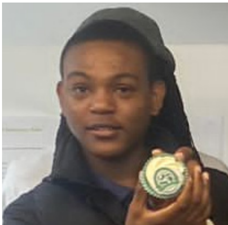
Memorable: armed with worthwhile goodies