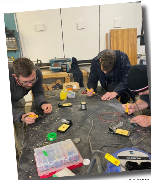
Participate: hands on experience from the YLP team

To ensure everyone gets the opportunity to thrive... everyone is treated with fairness and respect