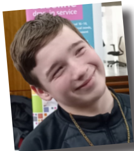
Engineer: "I have decided!"

Attendees discovered that entrepreneurs are individuals who sets up a business or businesses, taking on financial risks in the hopes of making profit. These are normally new ideas or bring a fresh, new or technological approach to an older business ideals. Opportunities and support for entrepreneurs and Start-Ups are abundant.